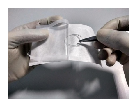
STEP 5 Place AMI1 on the step provided in AMI2.